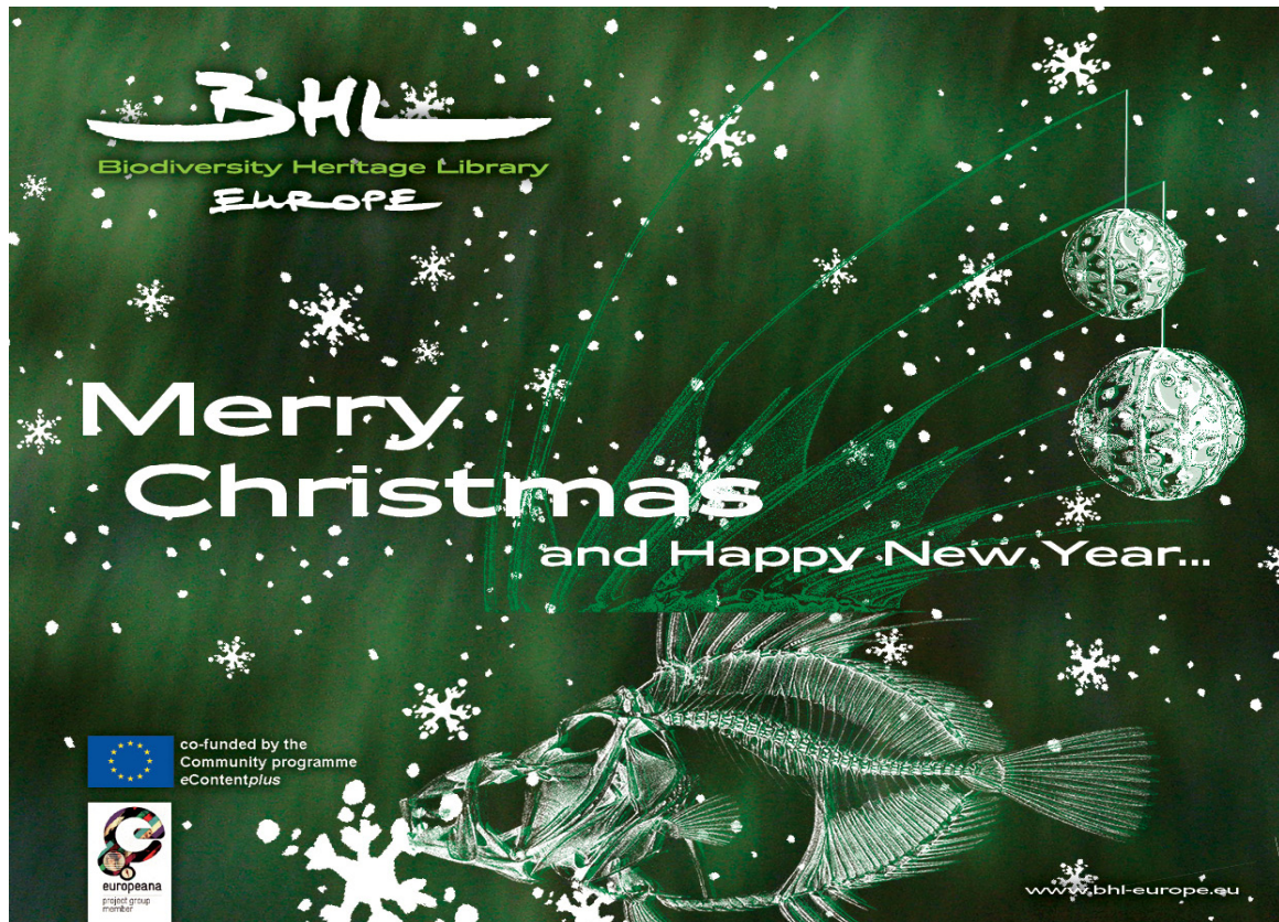
Figure 10 BHL-Europe Christmas Card.