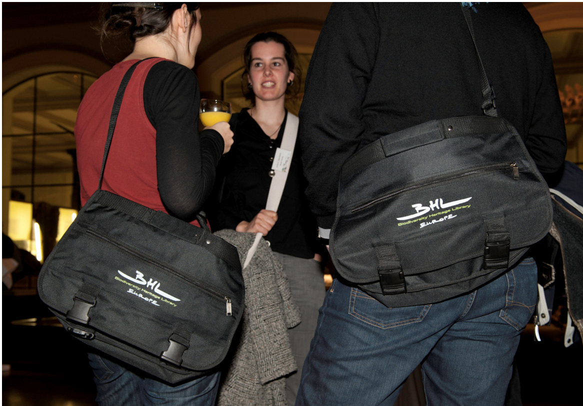
Figure 8 BHL-Europe's conference bags during the Icebreaker of the Biosystematics Berlin 2011.