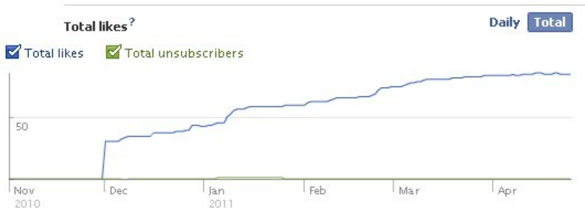
Figure 4 BHL-Europe's Facebook page followers (December (launch) – April)