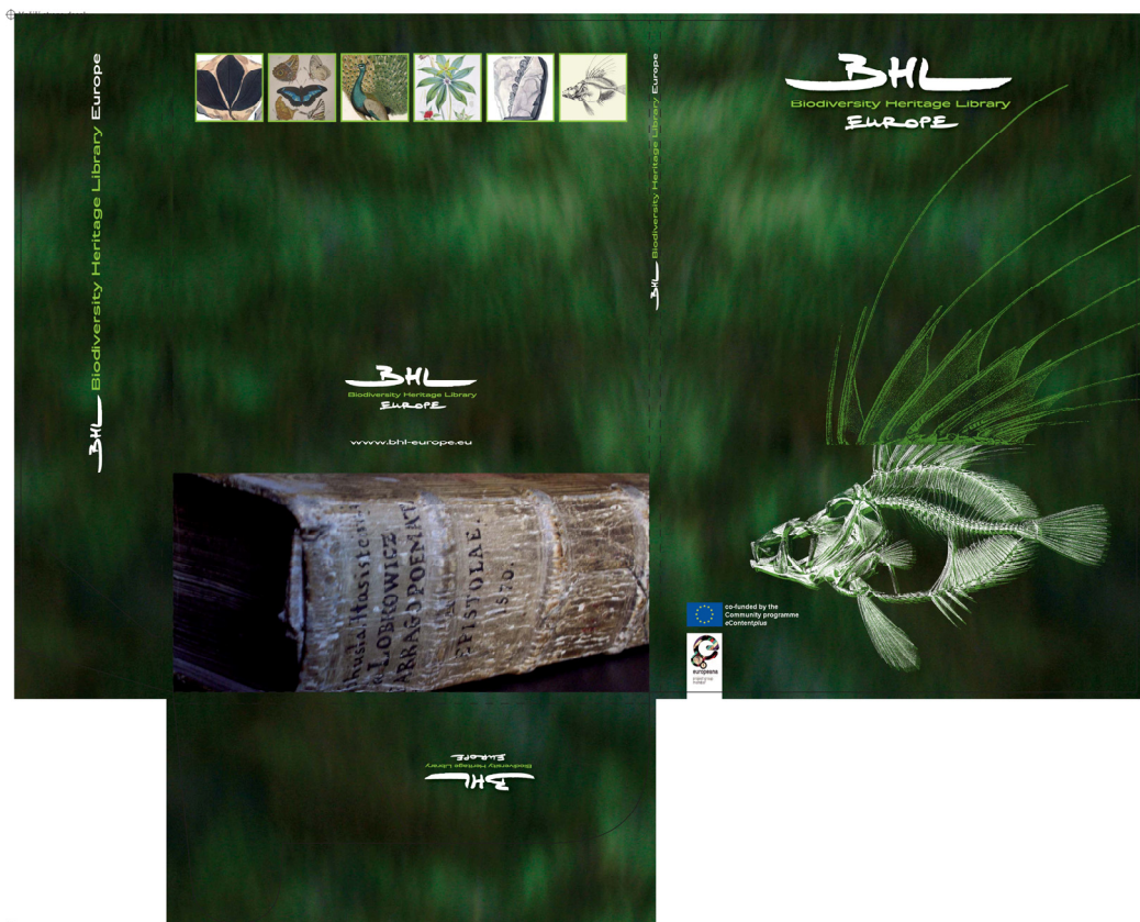
Figure 11 BHL-Europe folder design.