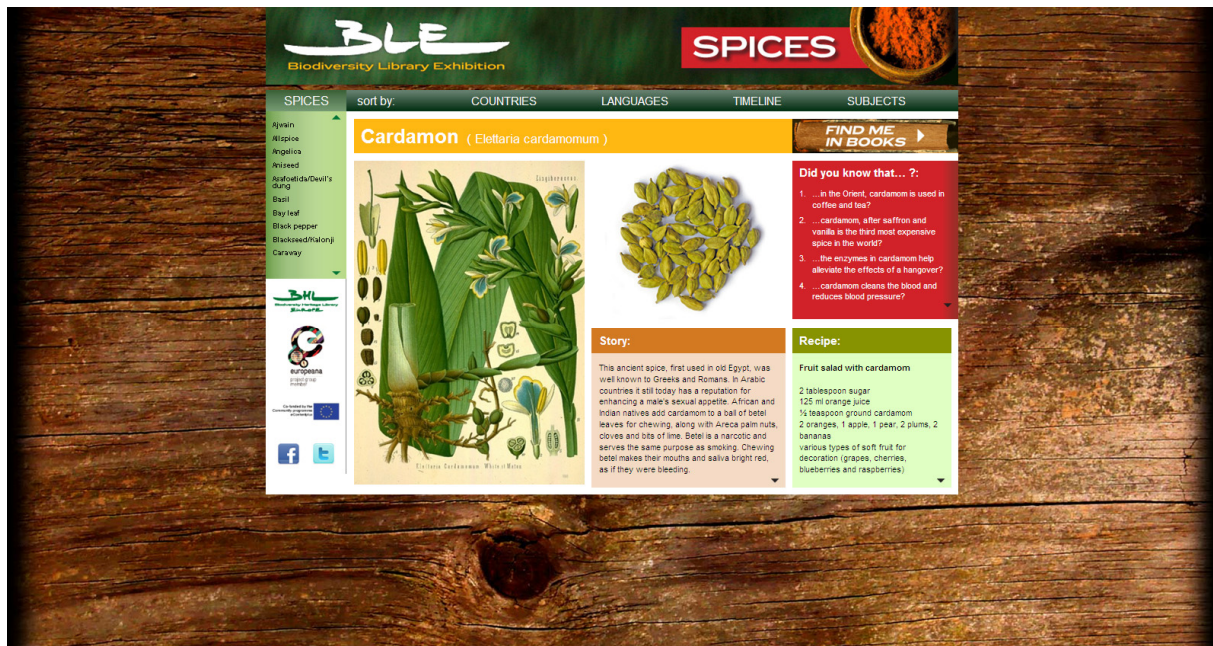
Figure 5 BLE - first prototype exhibition on 'Spices'

and Twitter by posting three news per week – ‘Spice of the week’, two ‘Recipes’ and a ‘Book of the week’.