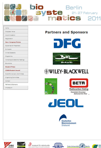
Figure 13 BHL-Europe as partner on the BioSystematics Berlin 2011 homepage.

In February 2011 hundreds of scientists gathered at the Seminaris Conference Center near the Botanic Garden and Botanical Museum Berlin-Dahlem for the BioSystematics conference where BHL-Europe played a major role as an organiser and sponsor (Fig. 13). BHL-Europe made a lasting impression on every participant by sponsoring the conference bags branded with the BHL-Europe logo, BHL-Europe flyers and the BHL-Europe's display stand right at the entrance of the conference centre.