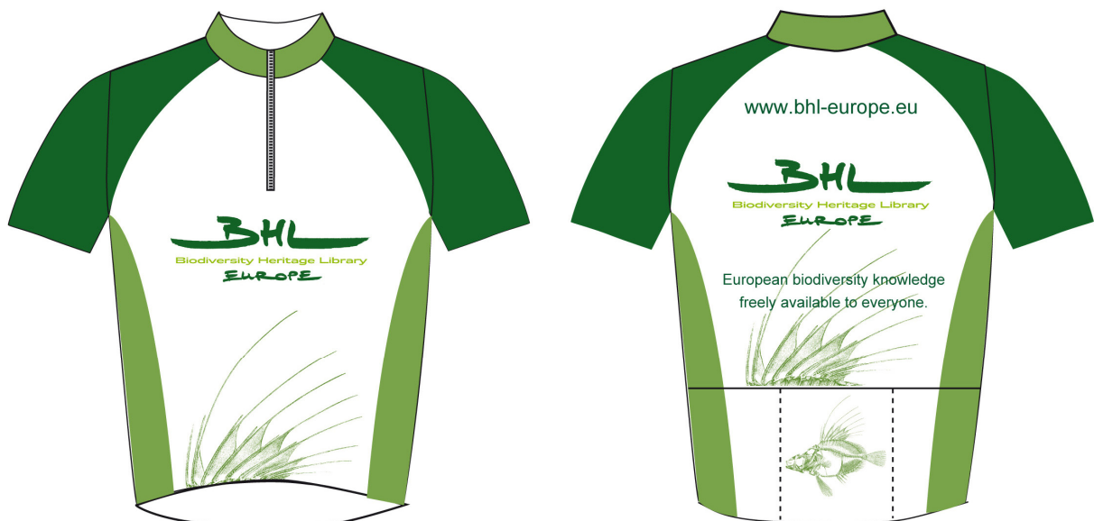
Figure 9 BHL-Europe's bike jersey.