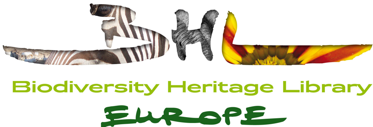
Figure 3 Example for a modified BHL-Europe logo.

As part of our business development work, we need to plan the transition of BHL-Europe from a project-based service into an operational service. In this context we are also working on the branding of the product and on new or modified logos that help in building up the BHL-Europe brand. NMP invested some time over the last months in conceptual and design work. In parallel we pushed the public presentation of the existing BHL-Europe logo to test the perception of BHL-Europe as a brand (e.g. during the BioSystematics conference). It turned out that BHL-Europe is well perceived in the community and the existing design concept works very well. As a consequence, NMP did some logo modifications to further support the brand building of BHL-Europe (example Fig. 3).