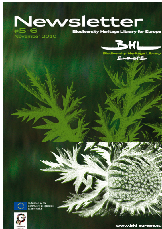
Figure 7 New main motif for the Newsletter in project year 2.