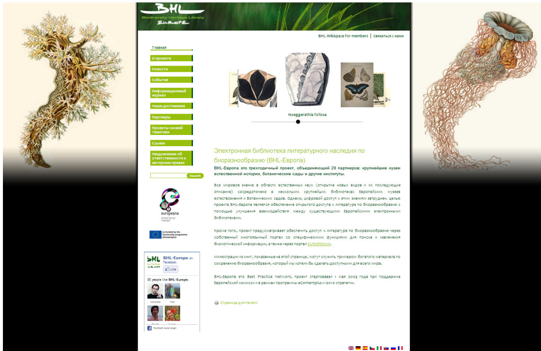
Figure 6 BHL-Europe Web site homepage in Russian.

general public and stakeholders. The conference bags proved to be particularly successful promotion material (see Biosystematics report below).