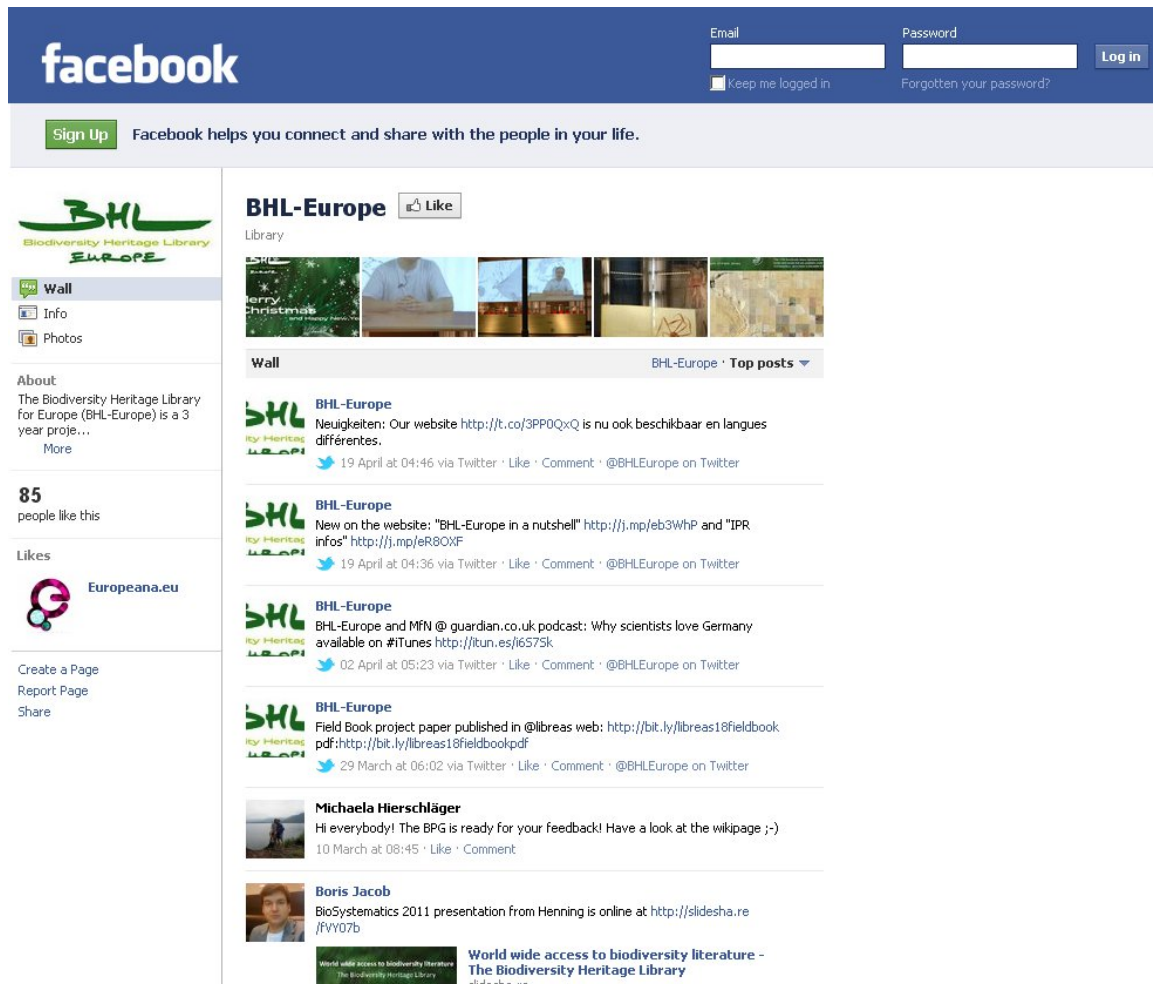
Figure 12 BHL-Europe's active Facebook page now widely accepted and used.

News on BHL-Europe and related projects were spread using the now fully implemented social media streams BHL-Europe Facebook 75 (Fig. 12), BHL-Europe Twitter 76 , BHL-Europe blog 77 and BHL-Europe netvibes 78 . In addition there was a contribution about BHL-Europe in the Guardian's Science weekly podcast 79 : “Why scientists love Germany” with Jana Hoffmann (MfN) explaining the project (between 4:10 and 4:55).